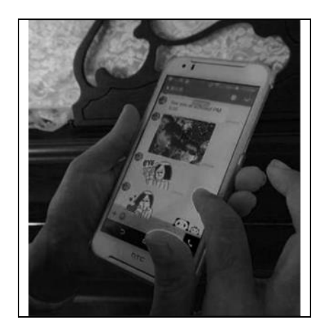
Figure 1 Parents can easily access their children at school over smartphones or other electronic devices through social networking apps

Line provides numerous group message functions, such as various transfer functions, free short message service voice calls, and multiservice support (Life is inseparable from LINE and FB 8 into the daily use of social communication apps, 2016) - see Figure 1. Based on the above statements, the working theory of the study can be described as: Using Line as a platform or bulletin can upgrade classroom management effectiveness through facilitating the interaction between teachers and parents. This explains why communication solutions such as Line can be closely associated with classroom management and parental involvement. Moreover, in an emerging economy such as South Africa, a society encompassing a wide variety of cultures, languages, and religions (Skinner, 2017) similar to that of Taiwan, it is necessary for the educational system to extend its focus from a unitary management method to a multiple management method by applying new digital technology into classroom management.