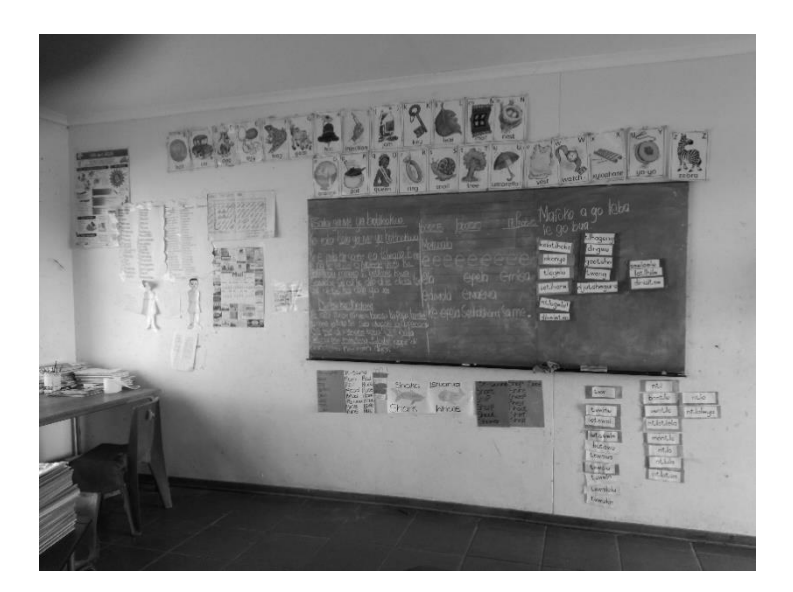
Figure 1 Flashcards displayed in Case Study 1 classrooms

The increase in instructional time, access to material resources, and the reorganisation of space to accommodate whole-class and small-group teaching appears to have increased teachers' confidence and motivation. Teachers talked about learners' improved performance. Grade 2 teachers reported that Grade 1 learners who had been exposed to the EGRS programme were better prepared. They also reported feeling more able to follow the proper method for group guided reading using resources.